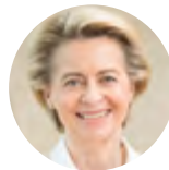
Ursula von der Leyen